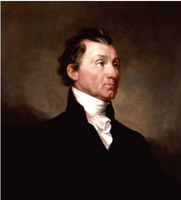
Portrait of James Monroe, by Samuel Morse, circa 1819. White House.

W e have heard much in recent years about Washington’s “Pacific pivot” aimed at deterring Chinese adventurism in the South China Sea and the “reassurance initiative” aimed at deterring Russian revisionism in Eastern Europe. What has received far less attention is Beijing’s pivot to the Americas and Moscow’s revival of Cold War-style intervention in the Western Hemisphere.