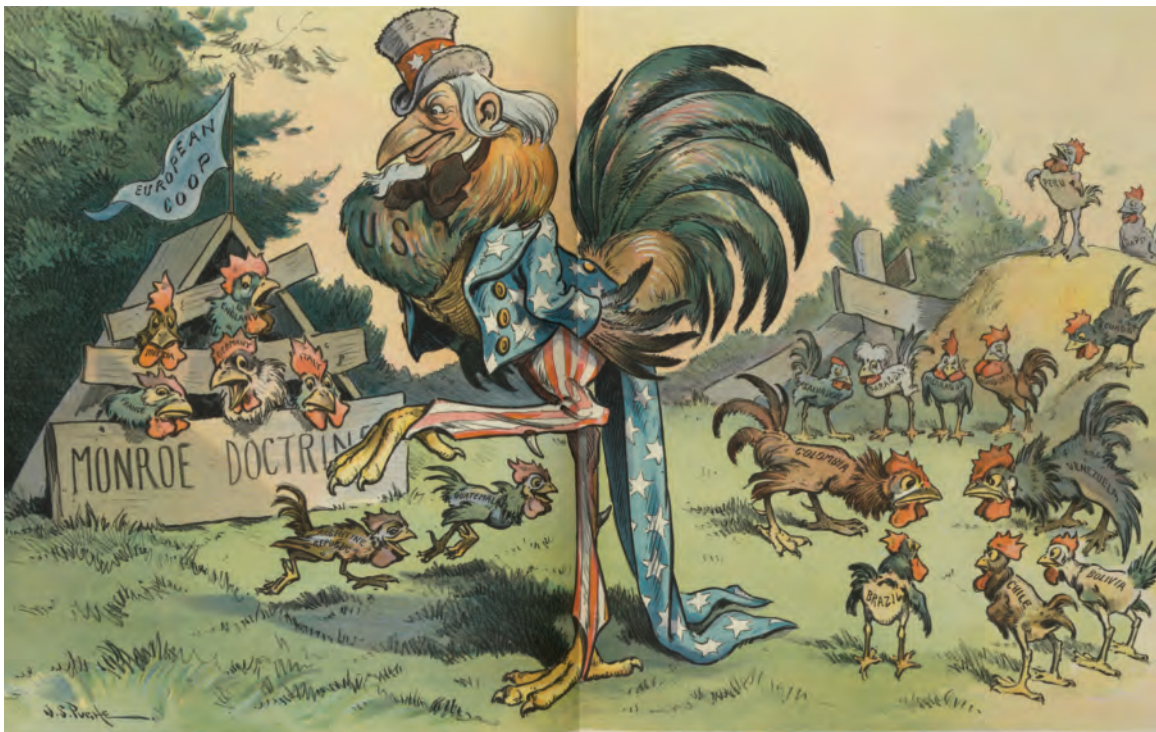
His Foresight, by J.S. Pughe, 1901. Originally published in Puck . Caption reads: “Europe—You’re not the only rooster in South America! Uncle Sam—I was aware of that when I cooped you up!”

impossible that the allied powers should extend their political system to any portion of either continent without endangering our peace and happiness,” he added. “The American continents...are henceforth not to be considered as subjects for future colonization by European powers.” 2