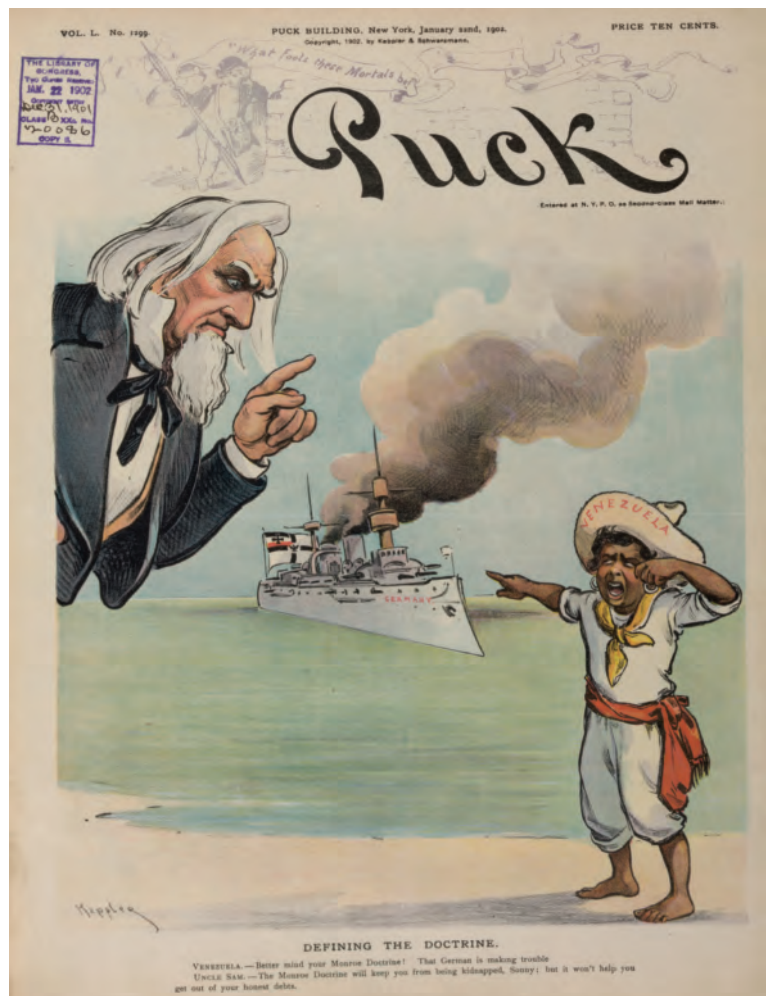
Defining the Doctrine, by Udo J. Keppler, 1902. Originally published in Puck.

Russia has unveiled plans to reopen a long-dormant intelligence facility in Cuba and to establish military bases in Cuba, Venezuela, and Nicaragua. "Negotiations are underway to allow port visits to each, and to open refueling sites...for Russian long-range aircraft," adds the American