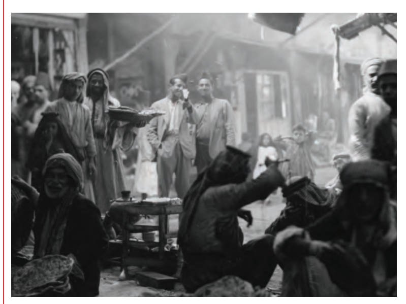
Mosul

Winning the war of ideas is the challenge that the George W. Bush and Obama administrations never engaged effectively enough. Barak Obama spoke of ISIS as the "JV" Team in the year it grew and conquered swathes of Iraq with furious speed. The Islamic State achieved in 2015 a goal that Al-Qaeda had projected in 2005 but which few observers expected to happen: the creation of a defined territory ruled by a Caliph.