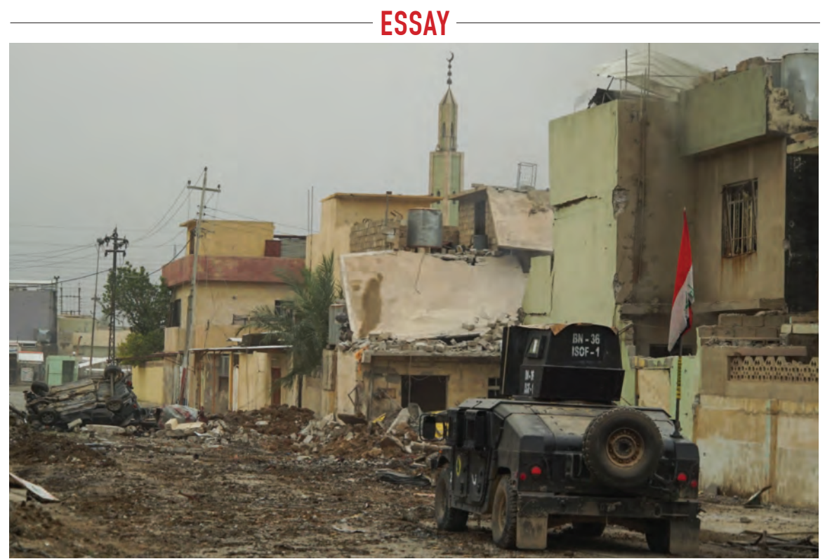
Nov. 16, 2016. Iraqi Special Operations Forces in Mosul, Iraq.