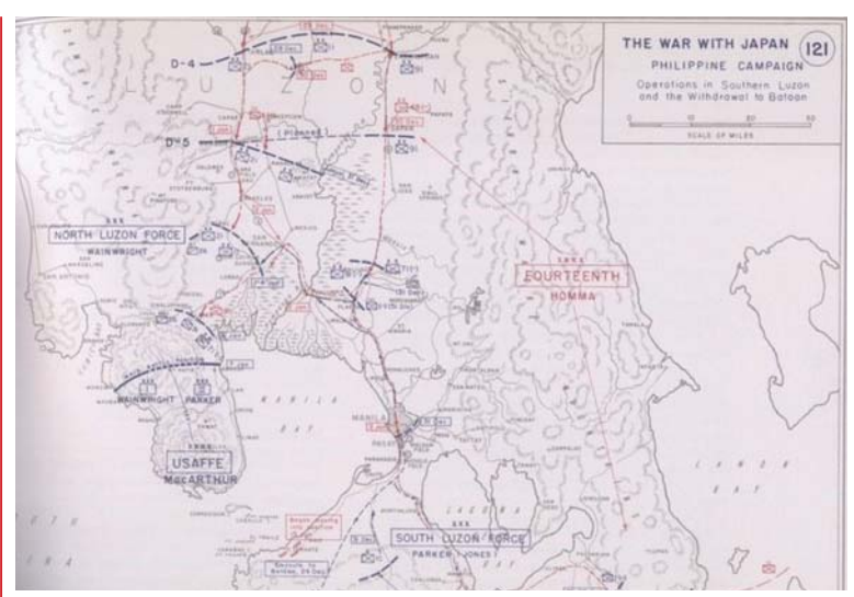
The War with Japan: Philippine Campaign Map 2, January 1942.

Disease also took its toll. "Bataan is a malarial infested region," wrote General Parker.