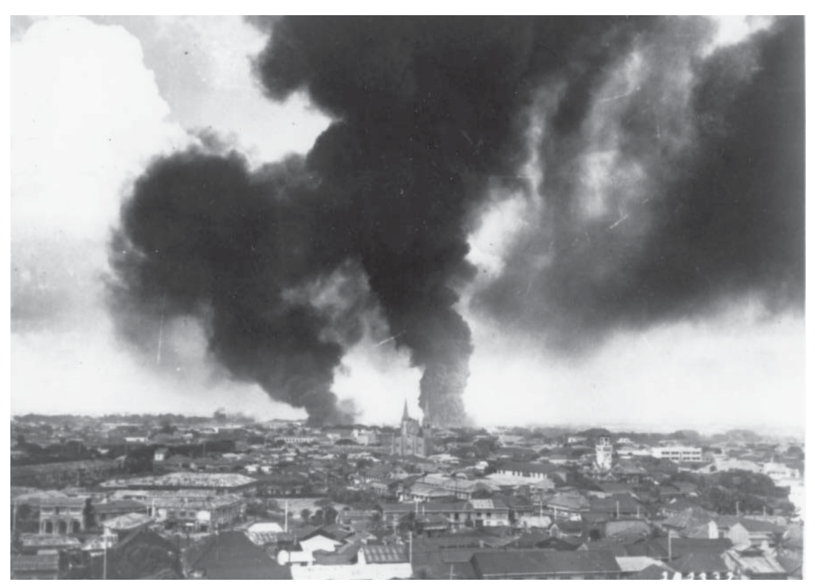
Manila Burns after an Air Raid, December 1941.

Three-quarters of a century ago, in the opening days of the Second World War in the Pacific, a joint U.S. and Filipino (Filamerican) army fought desperately to defend Manila Bay and the Philippines against a Japanese invasion. Much of the campaign (8 December 1941–6 May 1942) was waged on both the Bataan Peninsula and Corregidor Island in the mouth of Manila Bay. Despite