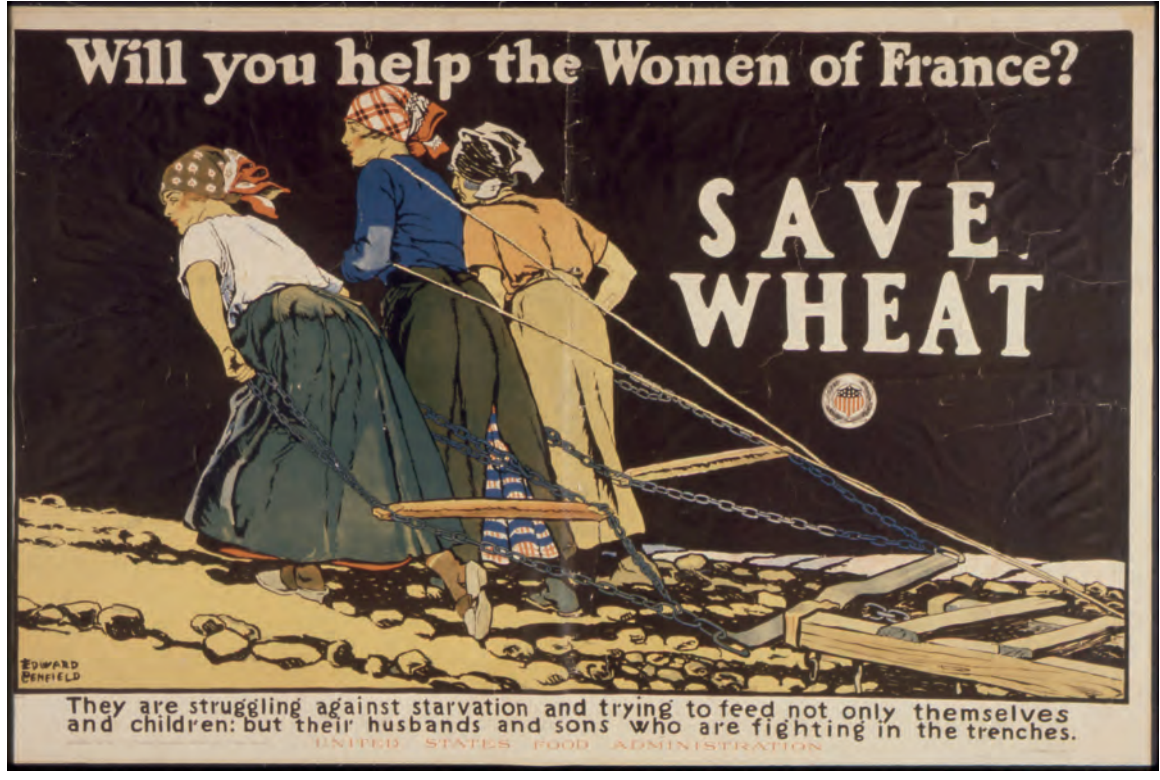
Will You Save the Women of France? Save Wheat, by Edward Penfield, circa 1917. Poster created for the US Food Administration, precursor to the American Relief Administration.