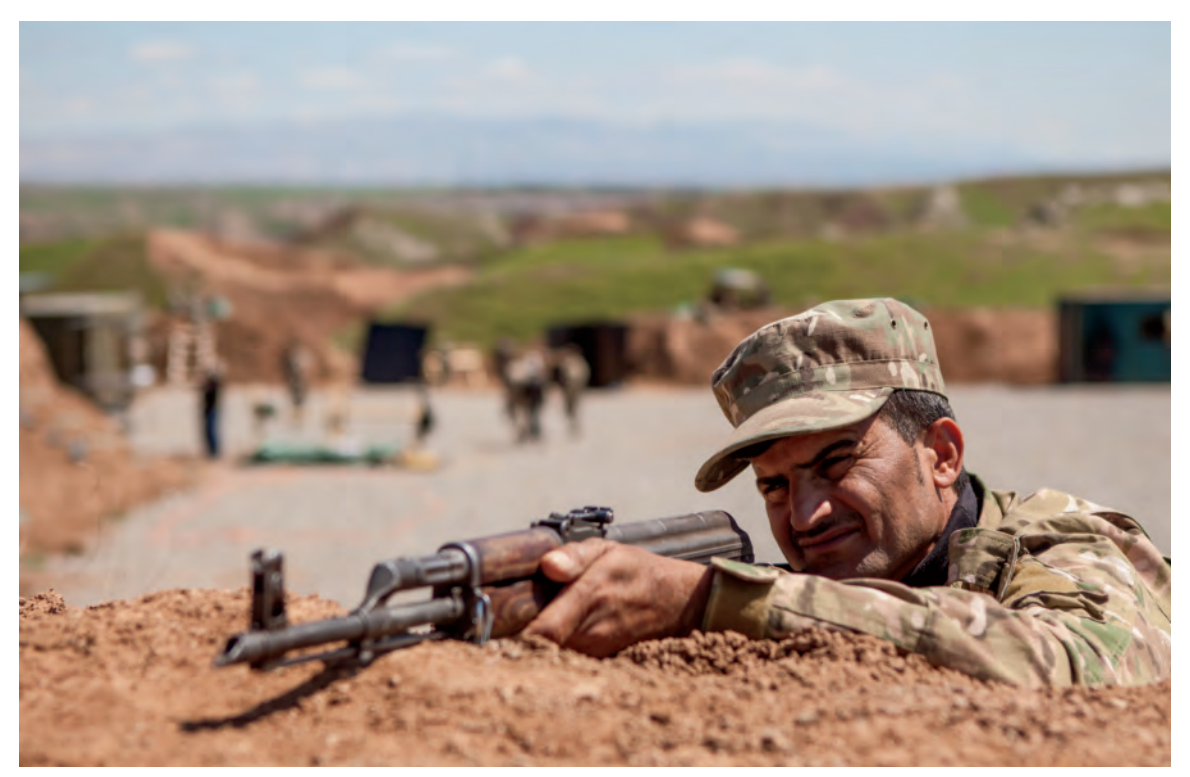
A Peshmerga soldier covering his sector of fire during urban operations training near Erbil, Iraq, on April 4, 2017. This training was an integral part of the Combined Joint Task Force – Inherent Resolve, the global coalition to defeat Islamic State in Iraq and Syria.

tention); means short of force must be judged as unlikely to stop the aggressor (last resort); the military option must be proportional to the threat (proportionality); and the consequences of action must not be worse than inaction (reasonable prospects).3