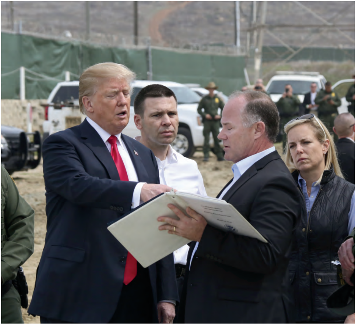
President Donald Trump visits the border wall prototypes in San Diego on March 13, 2018, with Department of Homeland Security officials, who listen to the president explain why walls are important to border security. By Ralph Desio. Source: US Customs and Border Protection.