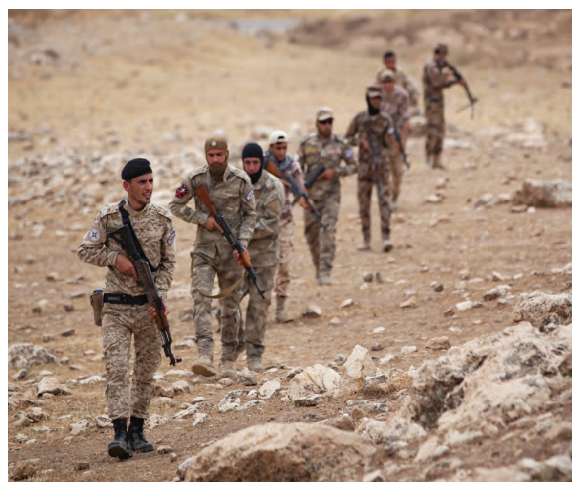
Soldiers from the Nineveh Plains Protection Unit patrol a mountainside during a react to contact training exercise at their training facility in the Nineveh Province on May 18, 2016. Training focused on the Combined Joint Task Force – Operation Inherent Resolve overall mission to build partner capacity and increase the military capacity of local forces fighting Islamic State.

in political fortunes would allow them to return to their homes. While they were once the only Christian militia, others have arisen.