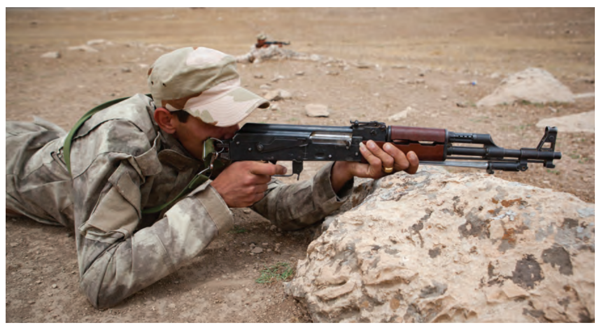
A soldier from the Nineveh Plains Protection Unit takes cover and returns simulated fire during react to contact training on May 18, 2016.

range of choices in deciding whether and how to mobilize their populations in armed groups. First, they can simply try to stay neutral and not mobilize at all. Second, they can encourage their members to join one side's armed forces as individuals in hopes of winning favor with that group. Third, they can mobilize militias and associate that force with one of the combatants. On top of these choices, minority leaders must also consider whether to mobilize as a unified entity or as a subgroup. Mobilizing as a subgroup may allow the group to pursue political goals or spoils, but it will also reduce the group's leverage while increasing its vulnerability.