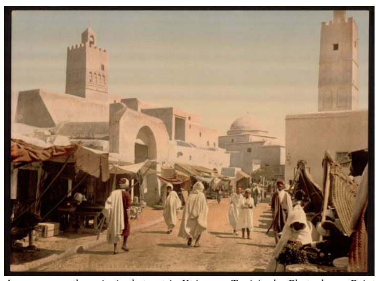
A mosque on the principal street in Kairwan, Tunisia, by Photochrom Print Collection, 1899. Source: Library of Congress.

ABRAHAM KUYPER, Lexham Press, 2018, 400 pages.