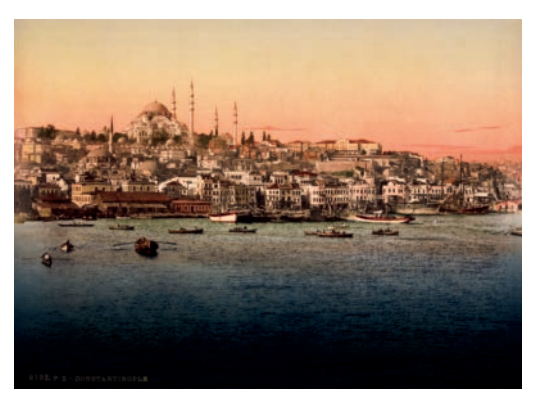
Constantinople, by Detroit Publishing Co, circa 1900.

strategy could be comprised of the goals set forth by Kuyper to benefit all of the country's citizens. Of course, the goals would need to be modified appropriately for each particular country, but the desired end result would be a better economy, fewer tribal feuds, better governance, and a modernized infrastructure. All could be done without any hint of quid pro quo. Relations with these countries would improve, and the impact long term could be significant in a number of areas.