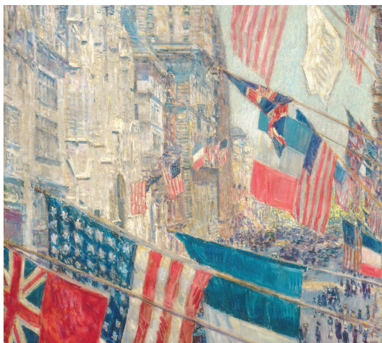
Allies Day, May 1917 by Childe Hassam, 1917. Source: National Gallery of Art.

When an Ebola outbreak in West Africa threatened to mushroom into a pandemic, America's military raced to the region to set up mobile labs and treatment facilities; deliver