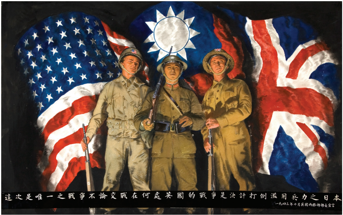
British poster from Second World War by unknown artist, October 1943. Chinese text reads, “This is the only war, regardless of where the British war is, that is determined to defeat the abusive forces of Japan.”