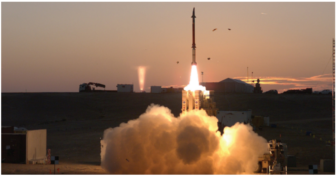
The Israel Missile Defense Organization (IMDO) of the Directorate of Defense Research and Development (DDR&D) and the U.S. Missile Defense Agency (MDA) successfully complete a series of tests of the David's Sling Weapon System on December 21, 2015. This test series was the final milestone before declaring delivery of an operational system to the Israeli Air Force in 2016.

transporter-erector launcher, lowered it in, taken the vessel out into the water, peeled back the top, erected it, fired it, lowered it, covered it up."15 Again, having the ability to move the launch pad makes a missile's range irrelevant. (Related, what if the next cargo ship to fire off a missile is owned by a stateless terrorist rather than a government? Deterrence, which critics of missile defense claim is the best answer to the missile threat, only works if the enemy a) fears retaliation and/or b) has a return address.)