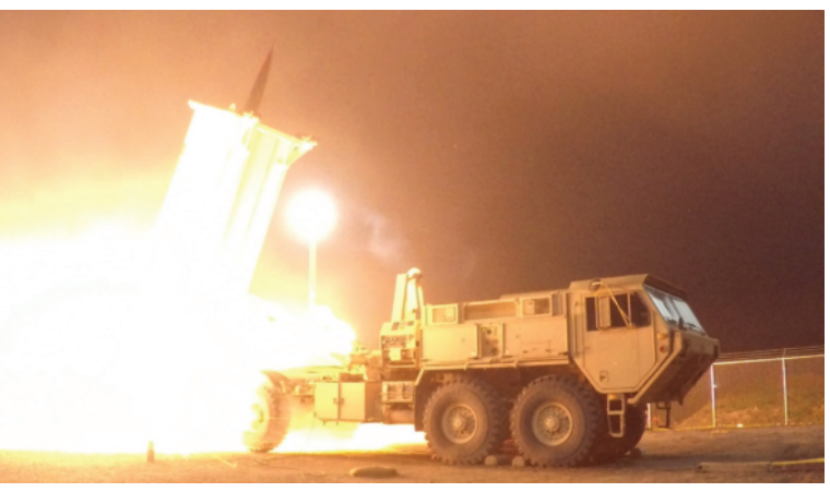
A Terminal High Altitude Area Defense (THAAD) interceptor is launched from the Pacific Spaceport Complex Alaska in Kodiak, Alaska, on July 30, 2017. During the test, the THAAD weapon system successfully intercepted an air-launched, medium-range ballistic missile (MRBM) target.

will extend "coverage to all Allied territory and populations."22 The U.S., Poland, and the Czech Republic-NATO allies all-agreed that year to the deployment of a bed of permanent ground-based interceptor missiles in Poland and supporting radar elements in Czech territory.23 In 2010, NATO leaders declared missile defense "a core element of our collective defense" and pledged to "develop the capability to defend our populations and territories against ballistic missile attack."24