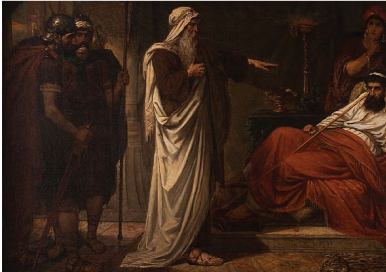
The Prophet Nathan Rebukes King David, by Eugène Siberdt, circa late 19th century.