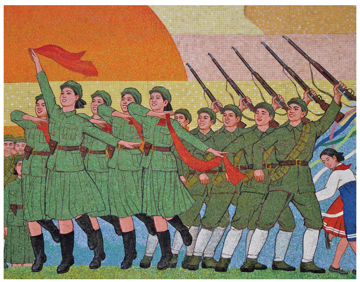
Detail from a North Korean propaganda mosaic mural that is roughly two stories tall.

one hears, what art one sees, what books one reads, what rank one has in society, and what regions, if any, one can travel to. Reading a novel or a work of history, religion, or philosophy; watching an unapproved movie; listening to non-Korean news; or privately questioning the regime—all are "crimes" that could send one to the gulag for life.<sup>2</sup>