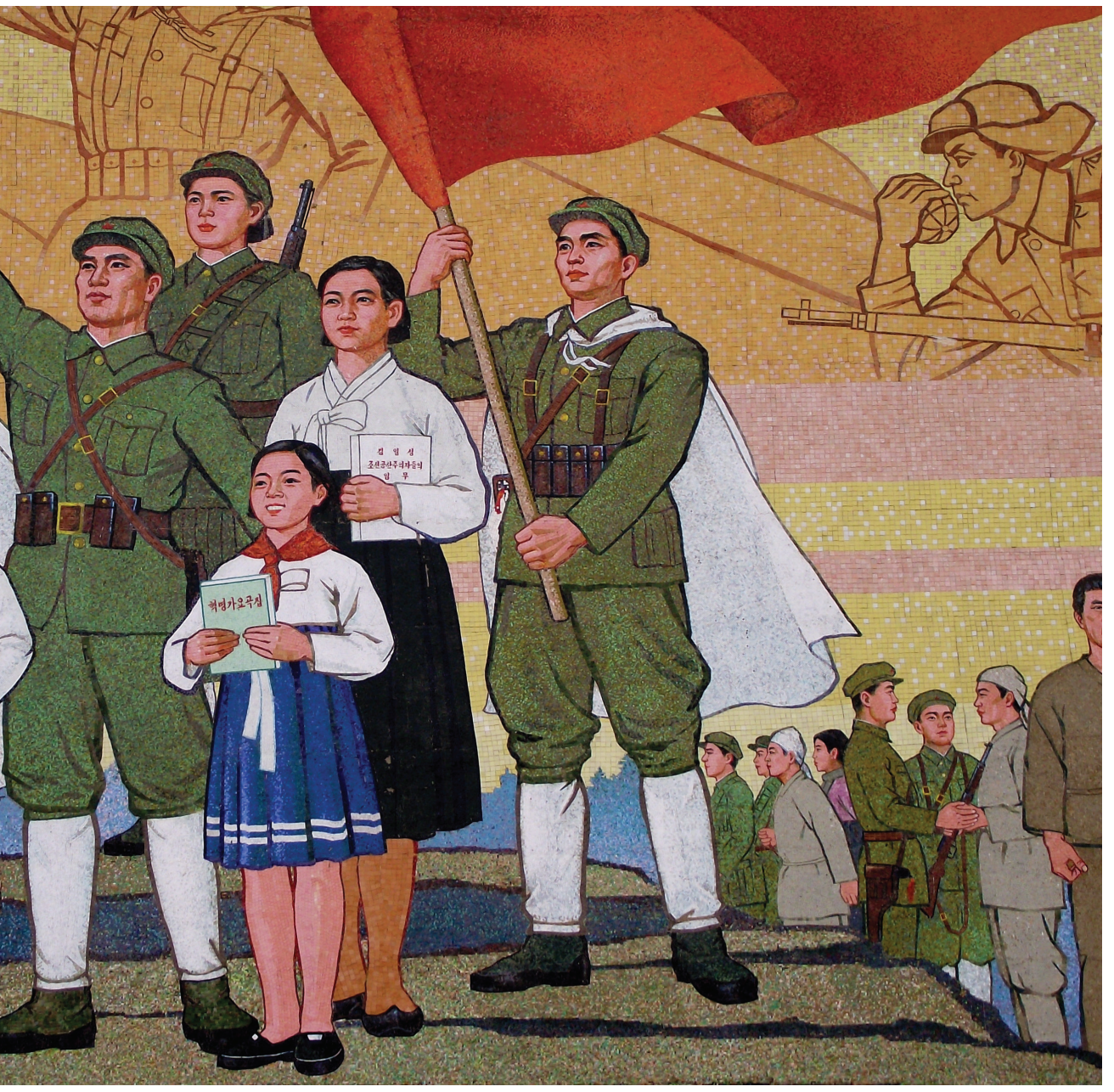
Detail from a North Korean propaganda mosaic mural that is roughly two stories tall.

But the administration still sent mixed messages. In Seoul in May 2015, while stressing the international community's united opinion that North Korea had to denuclearize, Kerry stipulated, "We are not seeking conflict, we are seeking a peaceful resolution of the differences that still exist after so many years on the peninsula." Although the United States was certainly right not to seek conflict, it was not necessarily right to tout