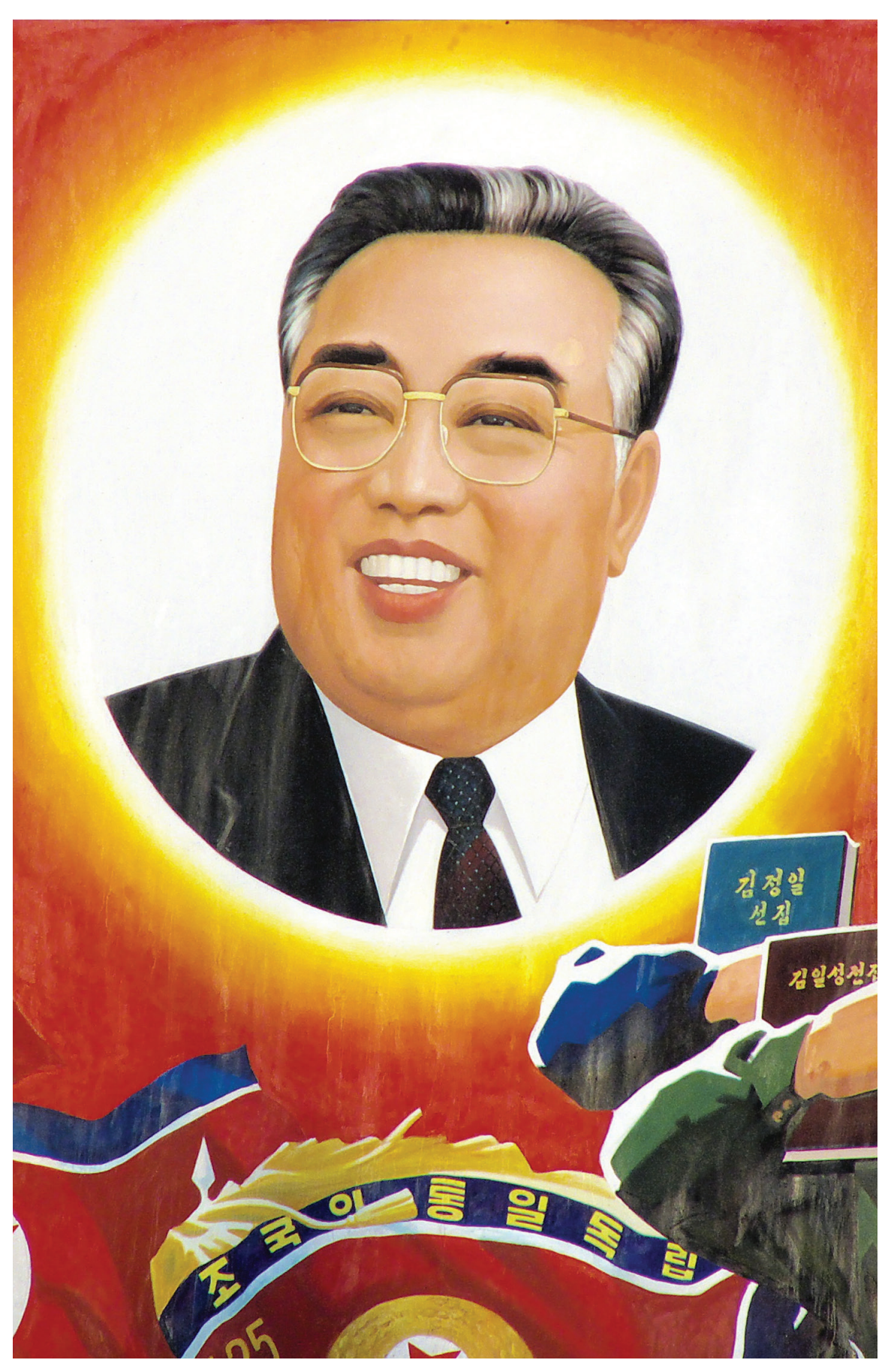
Mural of Kim Il-sung in Wosan, North Korea.