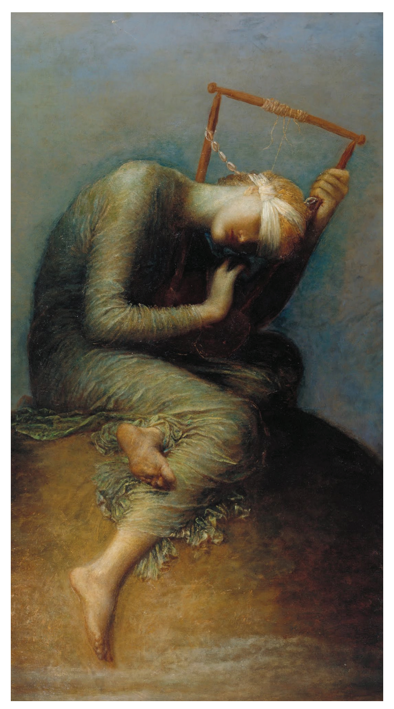
Hope (second version) by George Frederic Watts and assistants, 1886. Tate Britain, London.