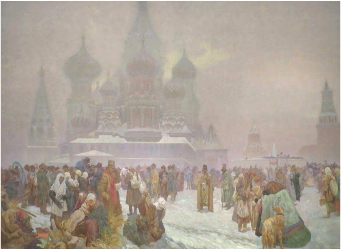
The Abolition of Serfdom in Russia, by Alfons Mucha, 1914. Prague City Gallery.

Two frameworks can help us better understand the so-called God gap in America's international affairs, specifically regarding Russia. The "God gap" references the conceptual gulf that opens up between a person—or nation—and their actions when we fail to account for the role religious belief plays in motivating their behavior. My aim, then, is to identify some ways in which religion may play a larger role behind