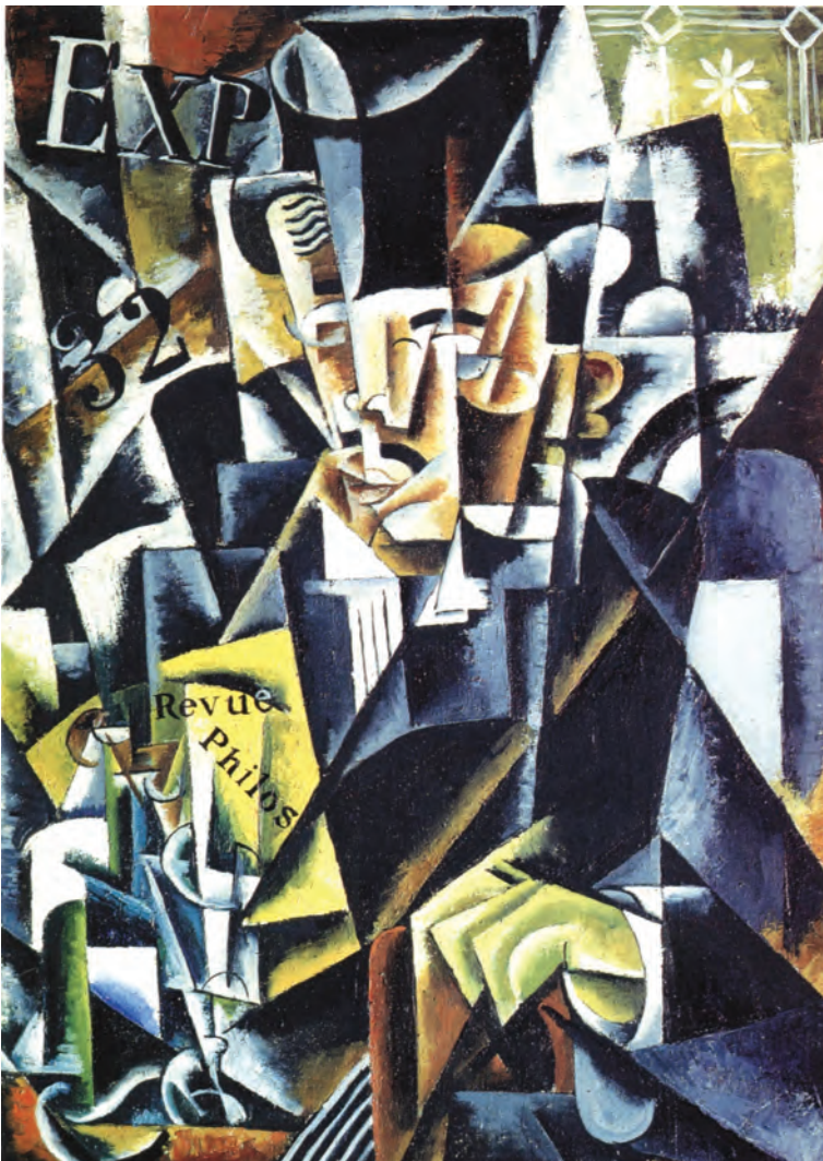
Portrait of a Philosopher, by Lyubov Popova, 1915.

U.S. interests. This is not only because certain kinds of conflict will not be ultimately won with tanks and airplanes alone, but also because a lack of understanding promotes dangerous policy mistakes. The plight of Christians in the Middle East gives but one example: