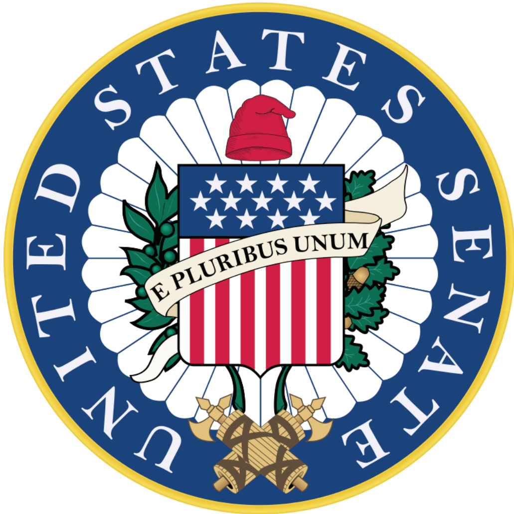
Seal of the United States Senate. An olive branch, symbolizing peace, graces the left side of the shield while an oak branch, symbolizing strength, adorns the right. Beneath are a pair of crossed fasces, the symbol of the Roman Senate, representing the magisterial power of such a collective body. Atop the shield hovers a Phrygian cap. Elsewhere the cap is found on the emblem of the Department of the Army, the Seal of the State of Iowa, and on the Coats of Arms of countries such as Argentina, Cuba, El Salvador, Haiti, and Nicaragua.

yet totally moved away from the doctrine of MAD. U.S. officials made clear in public statements that American cities would intentionally remain undefended from missile attack. This kept in place the imaginary, mechanistic “strategic balance” or “balance of terror.” Illustrating this principle, Secretary of State Henry Kissinger, arguing in favor of the 1972 Anti-Ballistic Missile (ABM) Treaty, which codified that neither the U.S. nor the Soviet Union would build effective missile defenses, noted that it gives missiles “a free ride” to their intended targets. 11