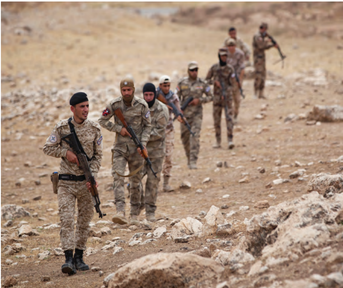
Soldiers from the Nineveh Plains Protection Unit patrol a mountainside during a react to contact training exercise at their training facility in the Nineveh Province on May 18, 2016. Training focused on the Combined Joint Task Force – Operation Inherent Resolve overall mission to build partner capacity and increase the military capacity of local forces fighting Islamic State.

in political fortunes would allow them to return to their homes. While they were once the only Christian militia, others have arisen.