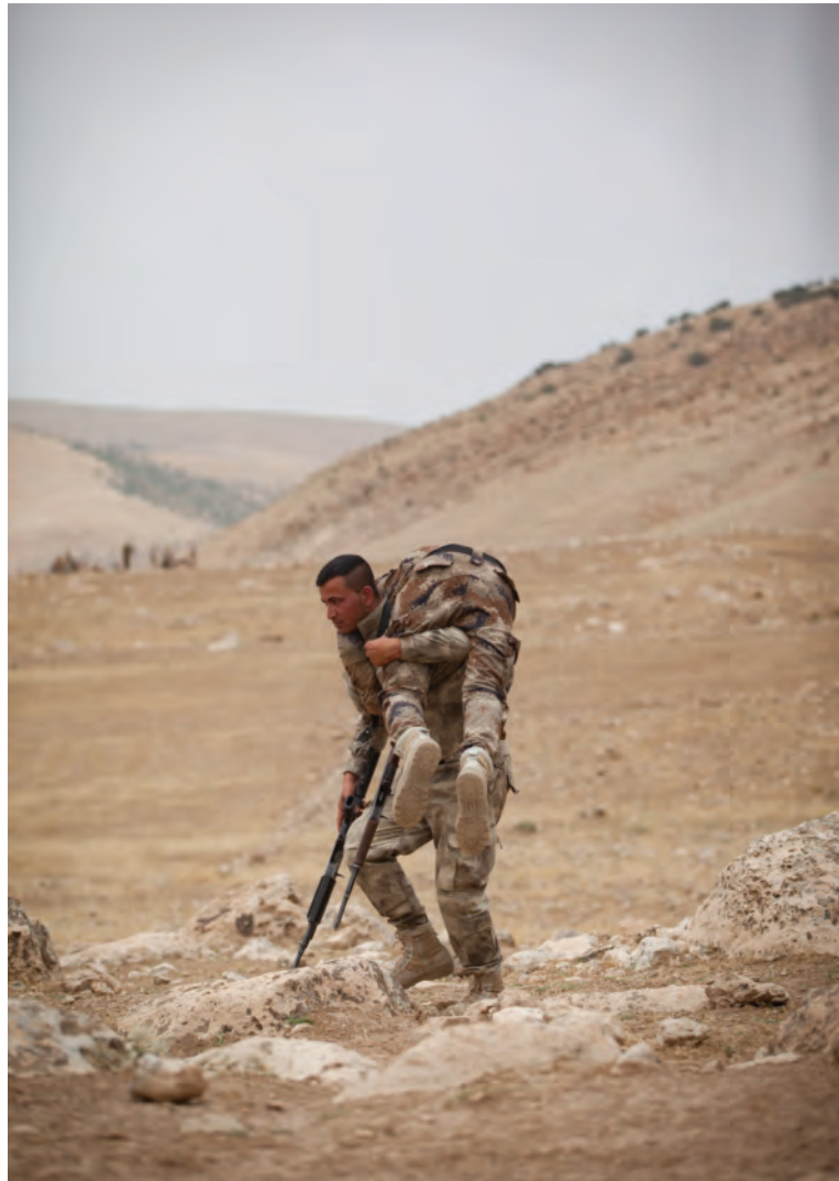
A soldier from the Nineveh Plains Protection Unit runs for cover as he carries a fellow soldier acting as a combat casualty during a react to contact training exercise on May 18, 2016.

The Iraqi Christians' fractured state presents a dilemma to United States policy-makers. The largest armed group, the NPG, remains in exile in the Kurdistan Region. Christian opinion on the Kurds, however, seems to be divided. Many members of the Iraqi Christian diaspora despise the Kurds due to their complicity with massacres of Christians in the early half of