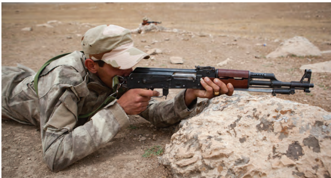
A soldier from the Nineveh Plains Protection Unit takes cover and returns simulated fire during react to contact training on May 18, 2016.