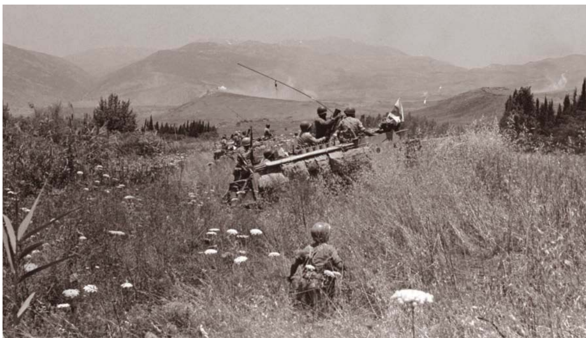
Israeli troops advance on the Golan Heights.

and in intelligence. In particular, Israel's commanders knew exactly where Egypt's air forces were stationed, the times its planes would be on the ground, and even the hours Egyptian pilots would be busy breakfasting. In that first wave of strikes, Israel's bombers all but destroyed the Egyptian air force on the ground and thus determined the war's outcome. Egypt's superior tank numbers counted for little while Israel controlled the skies over a vast desert battlefield with little place to hide.