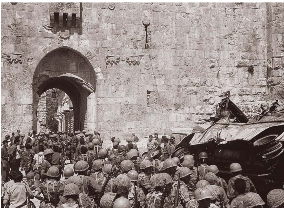
The breach. Israeli paratroopers enter the Lion's Gate on June 7, 1967.

having recaptured his former prestige. The Syrian regime was overthrown in 1970 by its Defense Minister, Hafez al-Assad, who eventually passed power to his son, creating a dynasty that has presided over the destruction of that country. The Soviet Union collapsed in 1989, its ramparts weakened by the protest movements of Soviet Jews and Eastern European dissidents that the war had aroused.