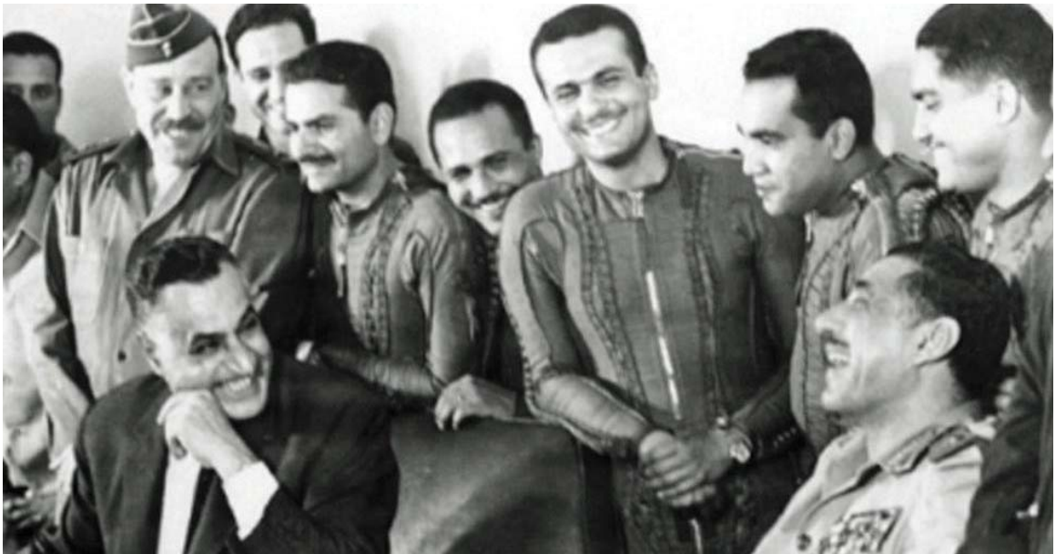
President Gamal Abdel Nasser in a jocular moment with Egyptian jet pilots at Bir Gifgafa air base in Sinai on May 22, 1967.

Israel's representative, Abba Eban, a man from the dovish side of the Israeli spectrum, deplored Israel's prewar borders as "Auschwitz borders" because they left the country only nine miles wide at its center and thus painfully exposed to attack. Moreover, those borders had little legal dignity, having derived from the ceasefire lines of the 1948 war that had never been codified into any treaty. From