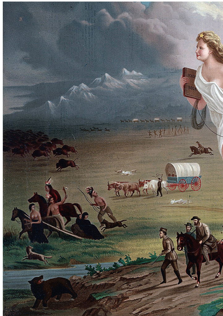
American Progress, by John Gast, 1872. A heavy-handed illustration of 19th-century post-millennial American optimism. Columbia brings technology and progress westward. In her wake comes the "light" to push out the darkness—as well as the bison and the Indians.

First, the eminence, the elevation or prominence, of the eschaton. What do I mean by that? The schema of history that the eschaton fits into is a very basic element of all three