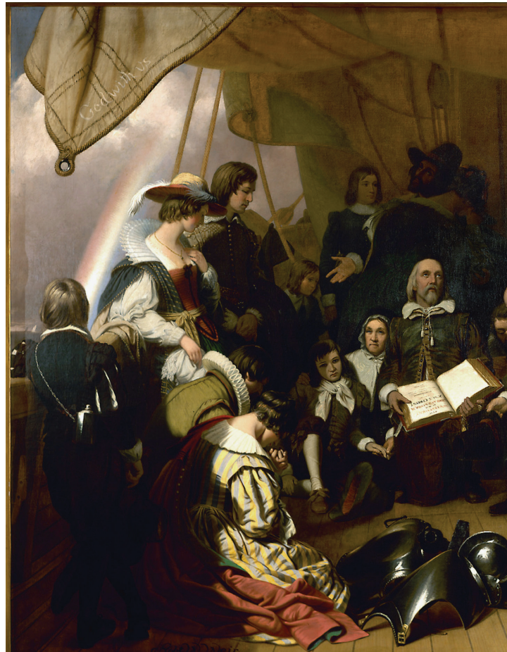
Embarkation of the Pilgrims, by Robert Walter Weir, 1844. U.S. Capitol Rotunda.

Contemporary versions of this kind of prediction are being made by people like Ray Kurzweil, but unlike Henry Adams, these Silicon Valley prognosticators look to artificial intelligence as the spark which will launch this end of history. At some point, they say, computers will become so smart they'll start to program themselves. We human beings will be helpless before our robot overlords, or something like that: one way or another,