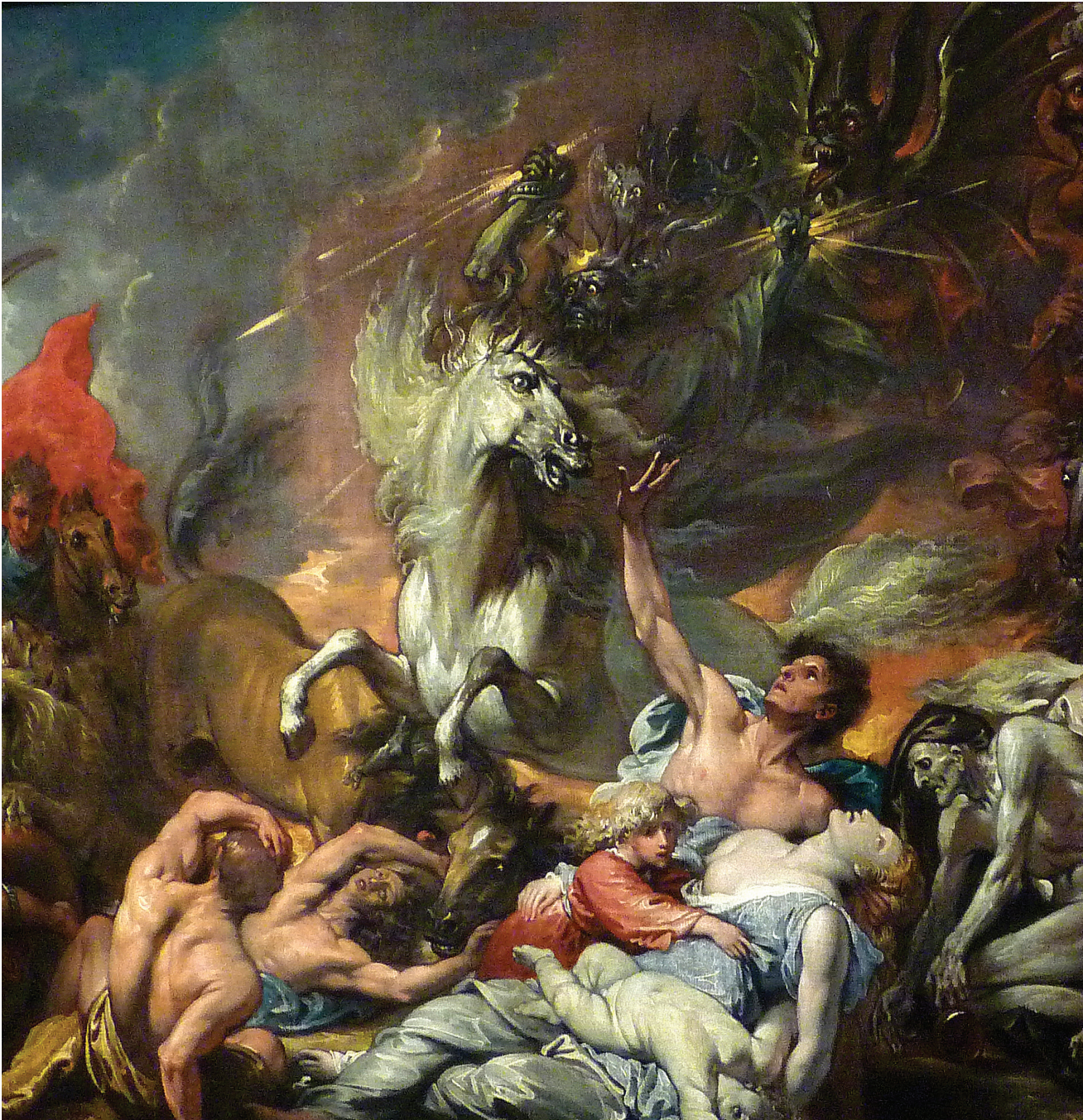
Death on a Pale Horse , by Benjamin West, 1796. Detroit Institute of Arts.